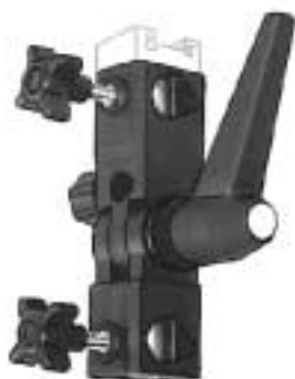
CSA438 Pro Umbrella Holder

Mounts any umbrella on light stand. Accepts all shoe mounting flashguns. Tilts 180°; swivels 360°. Fits all light stands up to 5/8". Black finish. 5" high; swivels in center. Blister packed.