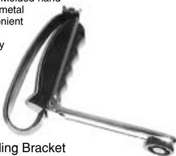
CSA413 One Touch Folding Bracket

All metal, folding 90° shoe bracket. Molded hand grip and rubberized bed over hard metal makes this bracket a sturdy, convenient device for use on 35mm cameras. Extremely portable as it folds neatly and can fit into clothes pocket. Opens up for use and snaps into position. Spring lock holds upright shoe arm tightly. To close, release spring. Cable release socket accepts most releases. Samigon blister pack. Master: 10.