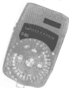
ATH313 Match Needle Exposure Meter D-3

Cine frames/sec: 8, 18, 24, 32, 64 f.p.s.