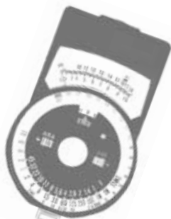
ATH315 Match Needle Exposure Meter F-4

Cine frames/sec: 8, 18, 24, 32, 64 f.p.s.