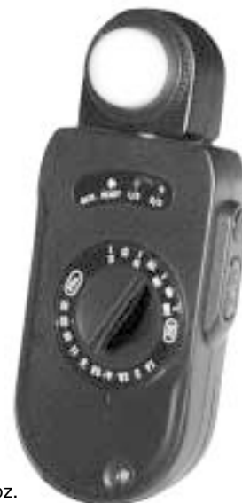
CSA580 Electronic Flash Meter

See Section G for Gray Cards and other exposure aids